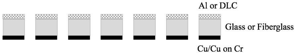
(Figure 1 (not to scale): The proposed special fluorescence suppressor electrode (FS-GEM)

The present work describes a possible alternative: insertion between the sensitive and the amplifying sections of the detector of a special electrode, named "fluorescence suppressor GEM" (FS-GEM), absorbing the photons generated by the incoming radiation in a multi-GEM structure (Figure 1). Manufactured on a thick glass or fiberglass plate, the FS-GEM has the electrode facing the drift made of a light material, Al or DLC; the other side can be a conventional Cu or Cu-Cr layer.